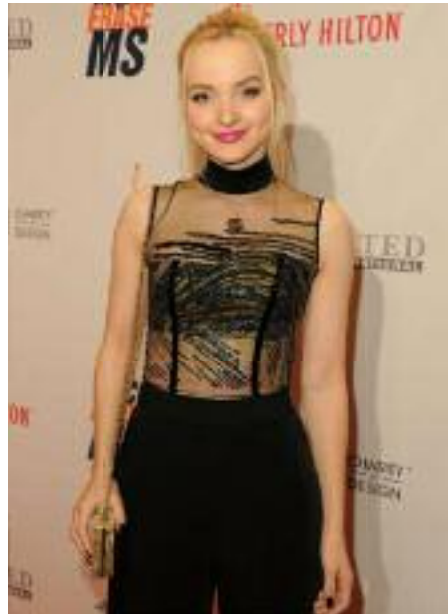
Dove Cameron At 23rd Annual Race To Erase MS Gala In Beverly Hills

http://www.celebzz.com/dove-cameron-23rd-annual-race-erase-ms-gala-beverly-hills/