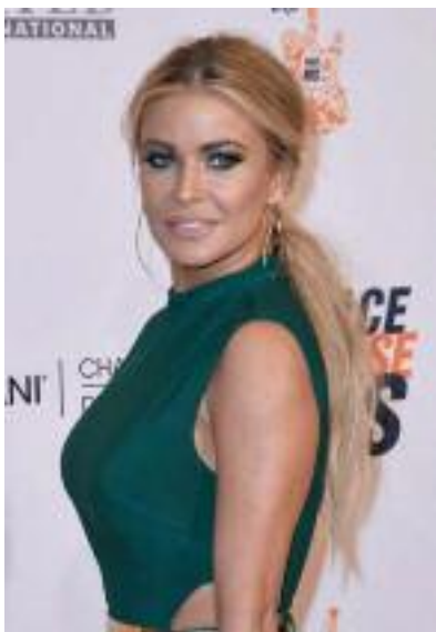
Carmen Electra - 2016 Race To Erase MS Gala in Beverly Hills

http://celebmafia.com/carmen-electra-2016-race-erase-ms-gala-beverly-hills-515897/