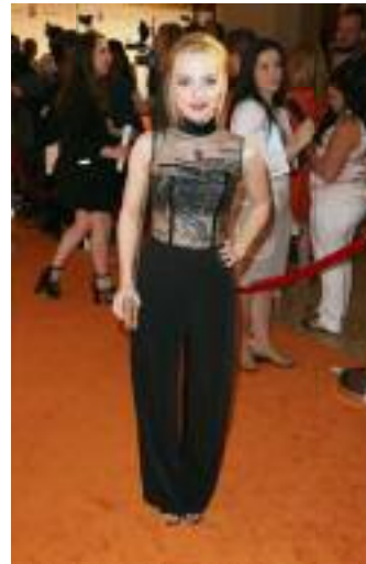
Actress Dove Cameron attends the 23rd Annual Race To Erase MS Gala at The Beverly Hilton Hotel on April 15, 2016 in Beverly Hills, California.

April 18, 2016 - 1:12 pm