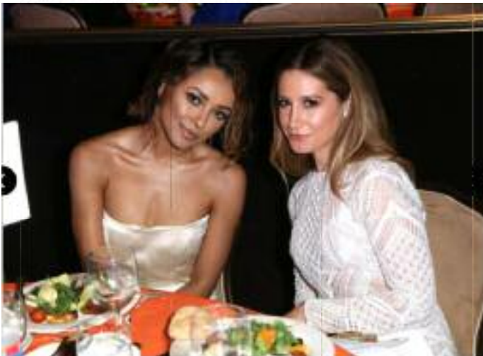
Actresses Kat Graham (L) and Ashley Tisdale attend the 23rd Annual Race To Erase MS Gala at The Beverly Hilton Hotel on April 15, 2016 in Beverly Hills, California.