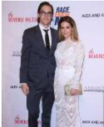
Ashley Tisdale stands out in white at charity gala red carpet

The actress glowed in shimmery makeup and sleek locks while holding tight to a small gold clutch on the carpet with her husband.