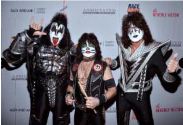
(L-R) Musicians Gene Simmons, Eric Singer and Tommy Thayer of KISS attend the 23rd Annual Race To Erase MS Gala at The Beverly Hilton Hotel on April 15, 2016 in Beverly Hills, California.