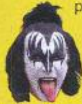
Kiss' Gene Simmons