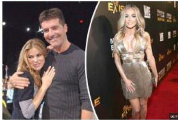
FIX Carmen Electra has claimed that Simon Cowell told her what to say on BGT