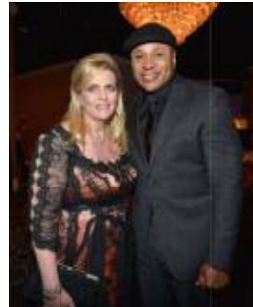
Host Nancy Davis and actor/rapper LL Cool J attend the 23rd Annual Race To Erase MS Gala at The Beverly Hilton Hotel on April 15, 2016 in Beverly Hills, California.