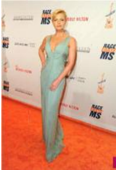
Actress Jaime Pressly attends the 23rd Annual Race To Erase MS Gala at The Beverly Hilton Hotel on April 15, 2016 in Beverly Hills, California.