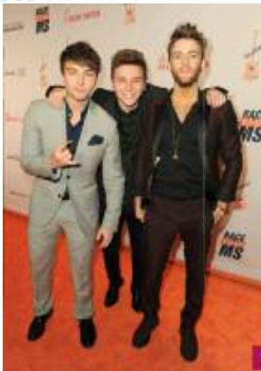
(L-R) Musicians Wesley Stromberg, Keston Stromberg and Drew Chadwick of Emblem3 attend the 23rd Annual Race To Erase MS Gala at The Beverly Hilton Hotel on April 15, 2016 in Beverly Hills, California.