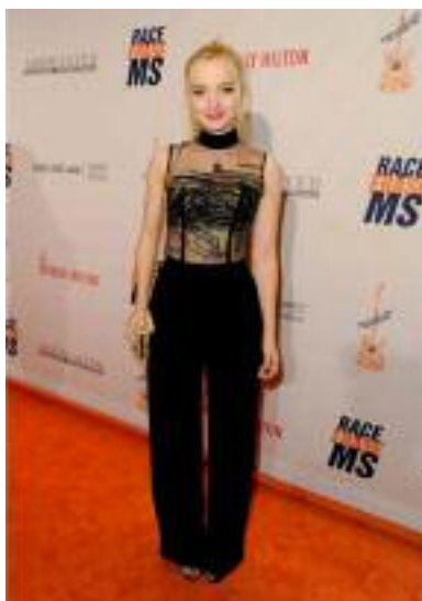
Dove Cameron - 2016 Race To Erase MS Gala in Beverly Hills

http://celebmafia.com/dove-cameron-2016-race-erase-ms-gala-beverly-hills-515897/