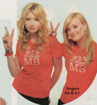
Singers Aly & AJ

Exclusively designed by Tommy Hilfiger, all sales of this tee support the Nancy Davis Foundation for MS. $25; shop.erasems.org